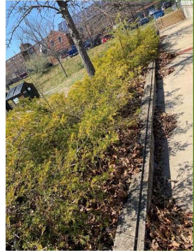
Behind Haverhill Beef