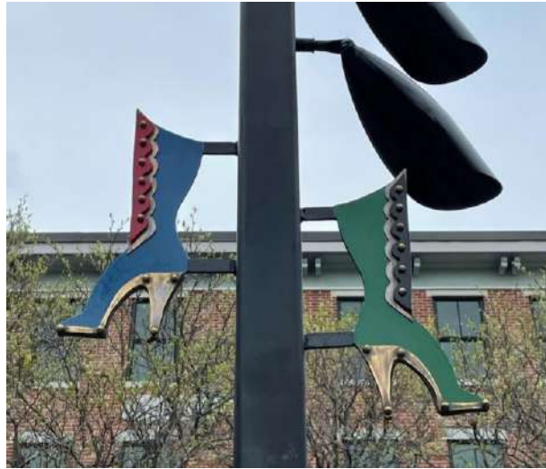
Shoe Light Post in Washington Square