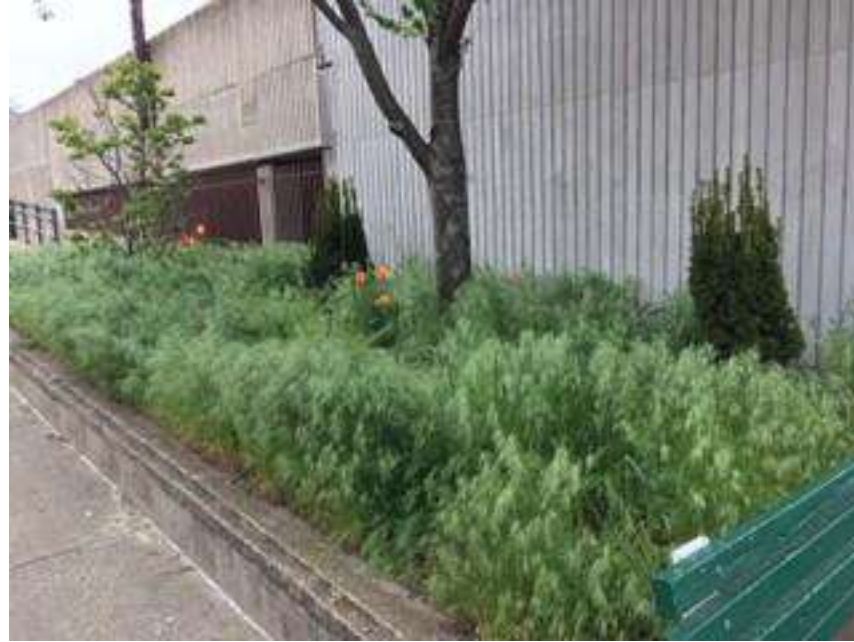
Goecke Parking Deck