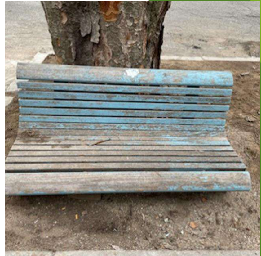
Bench in Wingate Parking Lot