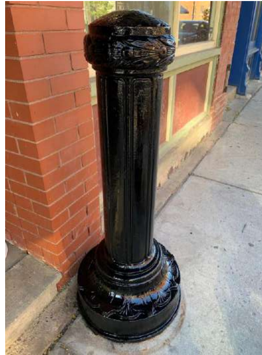
All 14 bollards