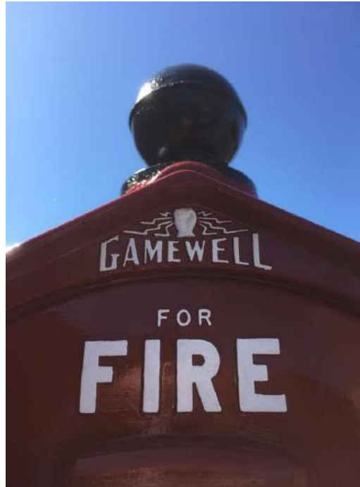
12 fire boxes