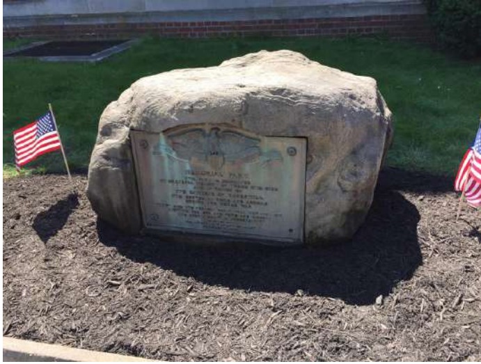
Veteran Monument at Post Office