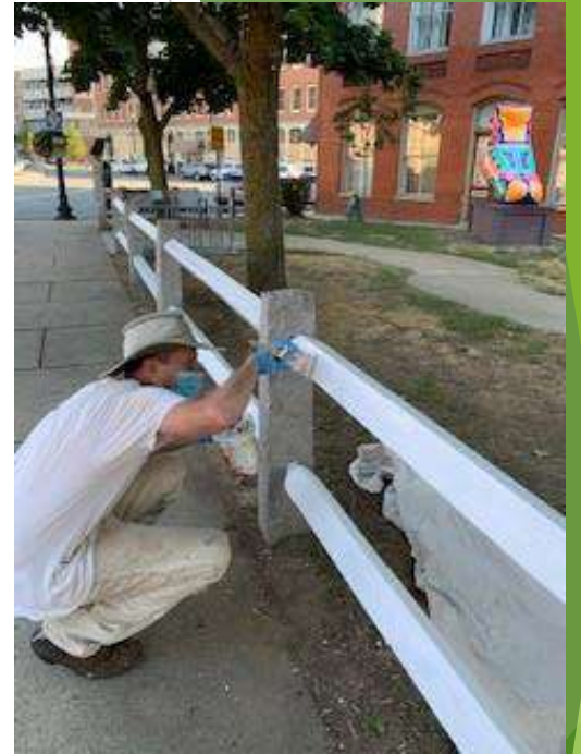
40 fence posts & cleaned 23 granite posts