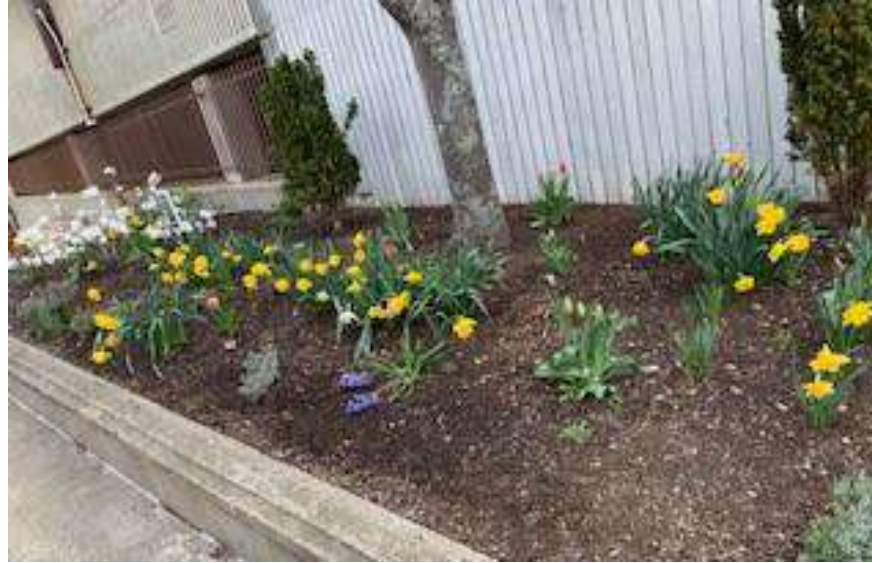
Goecke Parking Deck