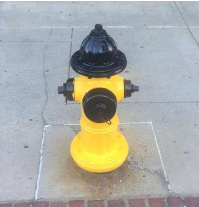
All 25 fire hydrants