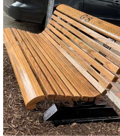
Bench in Wingate Parking Lot