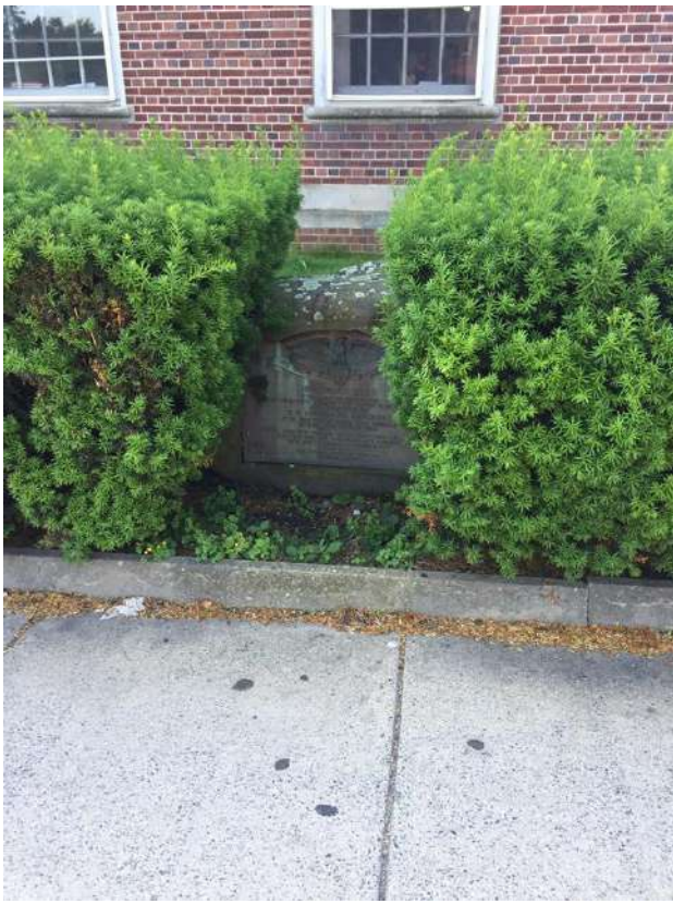
Veteran Monument at Post Office