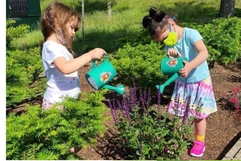
Behind Haverhill Beef