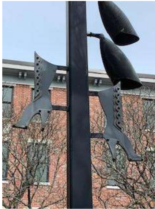
Shoe Light Post in Washington Square